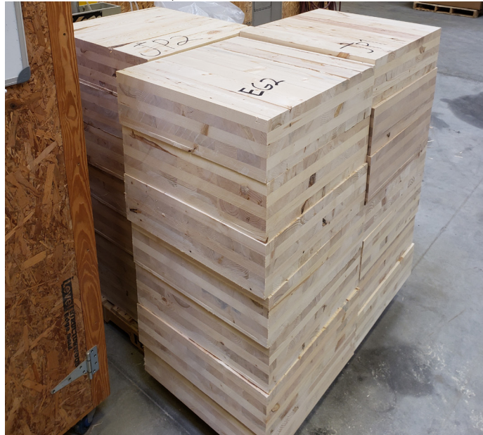
SPF-S billets Fabricated at UMaine for Bond Durability Testing

Unlike nail-laminated timber and dowel laminated timber, adhesive bonds must be used in the manufacturing of CLT and Glulam. These adhesives are responsible for transferring loads and providing durable bonds during the structure's service life. Recently researchers at UMaine evaluated the bonding performance of all the SPF-S species (listed at left), as well as two other commercially viable softwood species in the northeast: white pine and eastern hemlock, when used in CLT, to the acceptance criteria included in PRG 320.