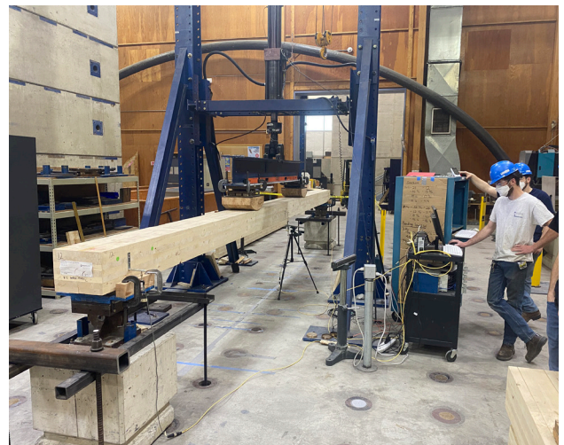
7-layer E21M1 CLT being tested at UMaine