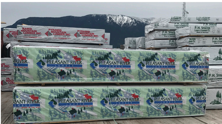
Maine lumber at the SmartLam LLC manufacturing facility in Columbia Falls, MT

The E21M1 grade has the highest published bending properties in the longitudinal direction of any CLT grade currently listed in PRG 320. The E21 grade is comparable to “E2” grade CLT, which is manufactured with Douglas-fir, a species known for its high stiffness and strength. Introduction of these grades to those currently available in North America will make manufacturers of CLT in Maine and New England more competitive with other regions domestically and globally.